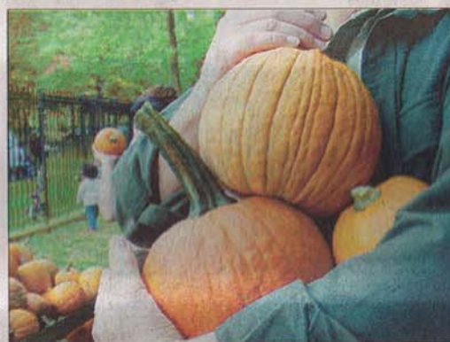
The Greenbelt's annual Pumpkin Festival is Saturday and Sunday.