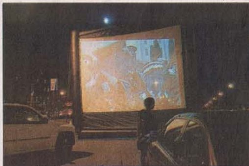
A scene from the film "Casablanca" plays on an inflatable portable screen in the St. George Municipal Parking lot during a test run for this weekend's outdoor film festival.

Admission is free, but there will be small fees for some activities. Call (718) 667-2165 for