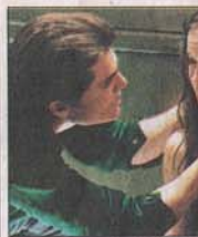
SENERITY: The big screen of the cult sci-fi TV show, is a bona fide hit. Sean Markey and Summer Glau are among the stars.